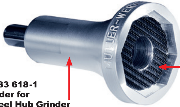
# 433 618-1 Holder for Wheel Hub Grinder